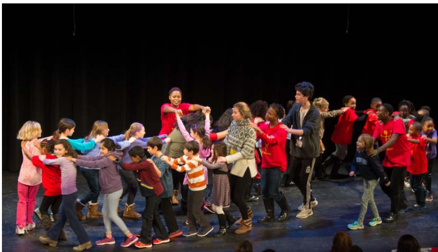
Bokamoso youth and children of St. Andrew's Episcopal School at the annual Bokamoso Dream Brunch