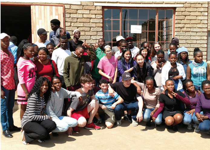
Bokamoso youth and students from St. Andrews Episcopal School.