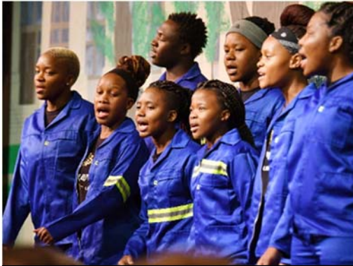
Performing at the Dream Brunch

2020 started out on a high note. We had a very successful Bokamoso Cultural Exchange and Performing Arts program. In January and February, the Youth danced and sang their way in to our hearts; and moved us with stories of their personal challenges and the ways in which Bokamoso lifts them up and helps them succeed. The Dream Brunch at St. Andrew's was an enormous success and raised approximately $24,00.00. They shined at their annual performance at George Washington University, and were a big hit at the Embassy of South Africa event. They also had opportunities to explore Washington with their St. Andrews host families.