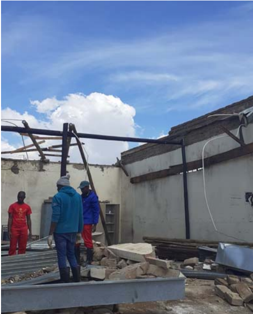
Bokamoso staff assesses the storm damage in April 2020.

In April , a storm hit Winterveld, causing catastrophic damage to the Bokamoso Life Centre’s pit toilet facilities and the garage, and damaging the kitchen roof, hall, and staff offices.