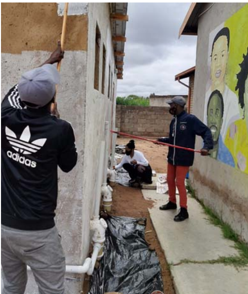
Bokamoso Youth and community members paint the new facilities.

This unforeseen challenge threatened to stall progress towards the Centre’s mission and programs and eliminate a vital resource to youth throughout Winterveld. Estimates for repairs came in at over R153,600, or close to $9,600 U.S. dollars.