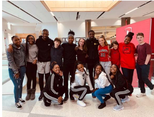
Having fun with SAES friends

For more pictures and videos from the 2020 trip, or to get more information about the 2021 Virtual Events, check out our new website: www.bokamosoyouth.org , or follow us on Facebook and Instagram.