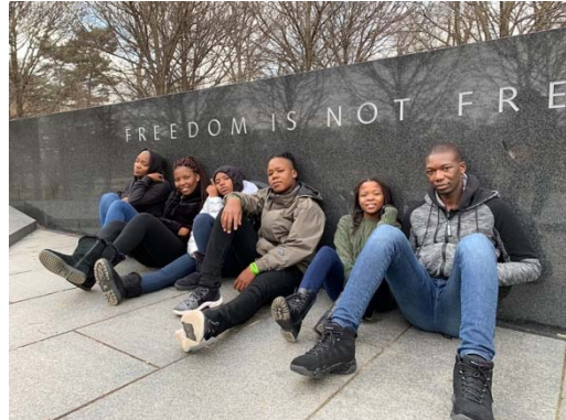
Touring Washington D.C.