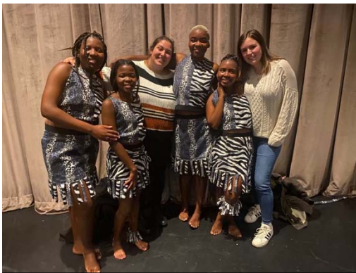
Enjoying the GW performance